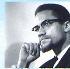
El Hajj Malik El Shabazz