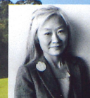
Maxine Hong Kingston