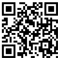
Oakes College Website